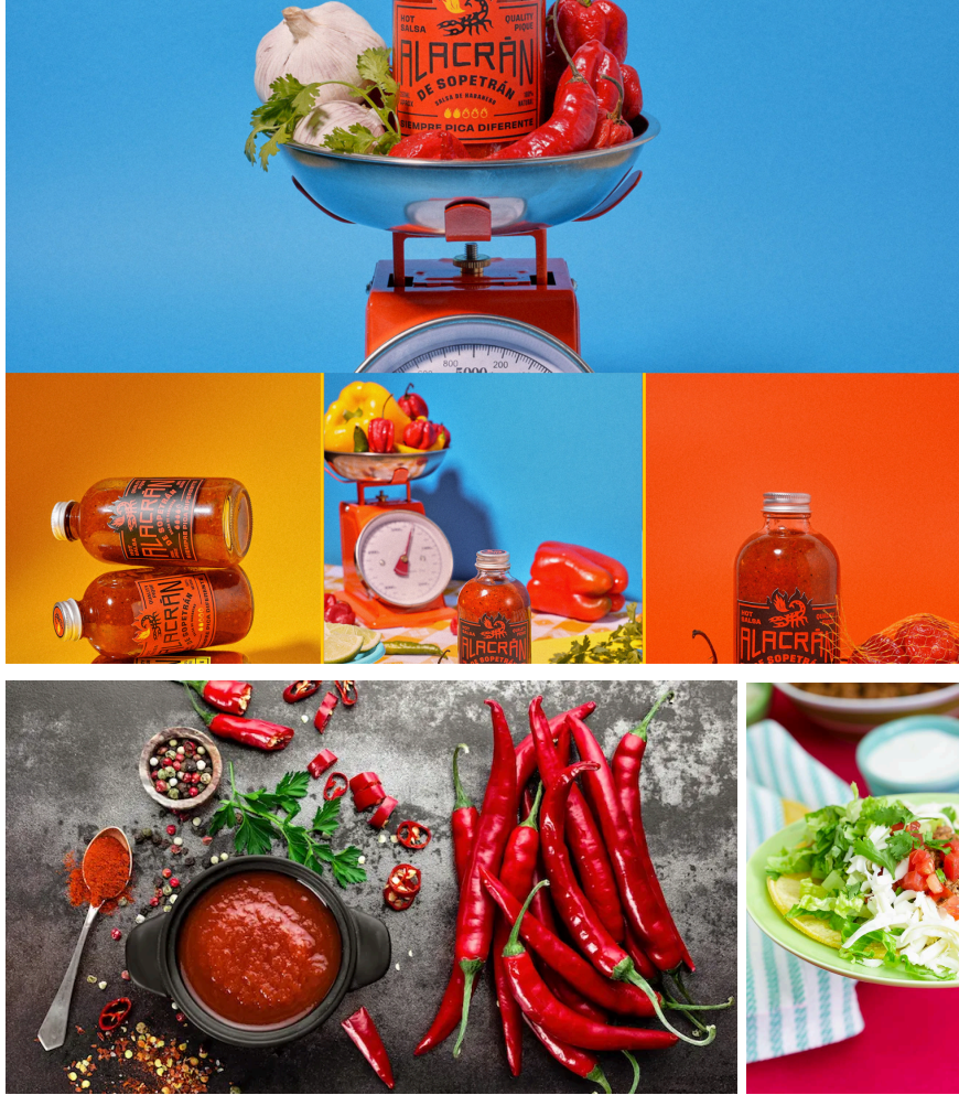
Showing sauce and dish side by side may be an approach to consider?